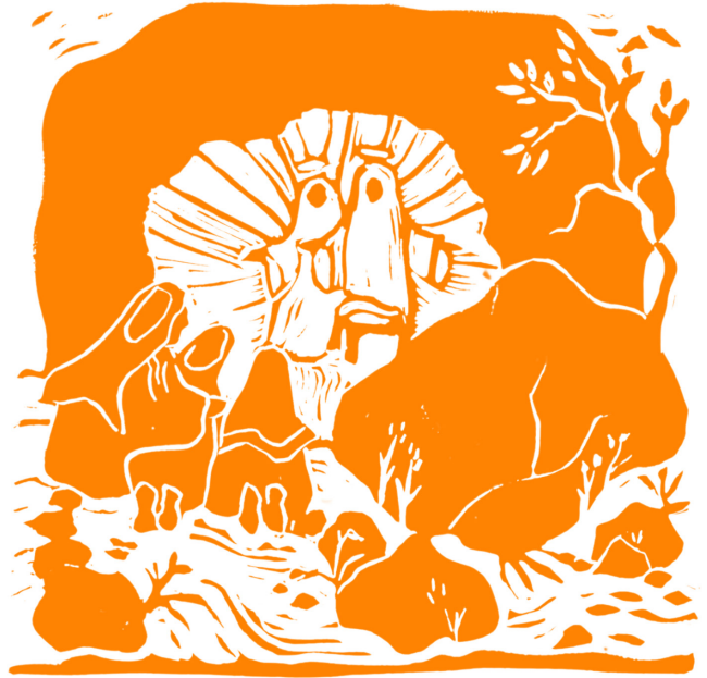
Easter Morning by Cara B. Hochhalter, 2019

*Please stand, as able, when indicated by asterisk. Bold text indicates congregational response.